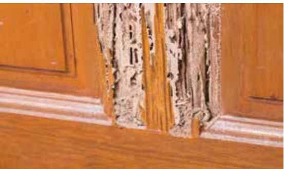
Termite damage in a home

home. Soldiers are tasked with protecting the colony, and often have a larger head and mandibles used for defense. Reproductives are for, you guessed it, reproduction. In the spring as temperatures rise to the low to mid-70's, swarms of winged reproductive termites emerge from their colonies by the thousands in search of a mate to start a new colony. This mating period is known as swarm season.