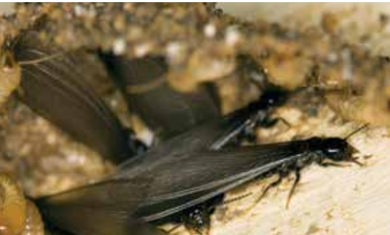
Winged reproductive termites