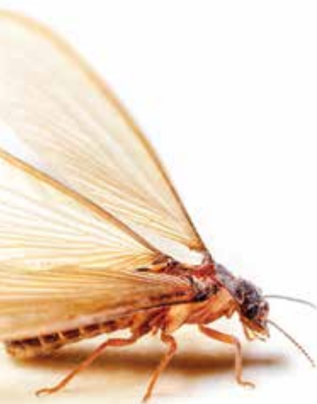
Winged reproductive termite

Subterranean termites are eusocial insects that live mostly underground in groups known as colonies. They are considered eusocial insects because more than one generation lives together, they cooperate with each other to raise their young, and they have specialized castes, or roles, that perform specific functions for the colony. Each termite colony has three primary castes: worker, soldier and reproductive. Workers are small, creamy white termites that measure about 1/4 inch long, and are responsible for the feeding damage to your continued on page 2